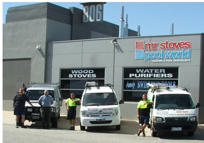
Mr Stoves Pool World 's Dedicated Service Team

Just phone us on 6021 6477 to arrange a suitable time for all service requirements.